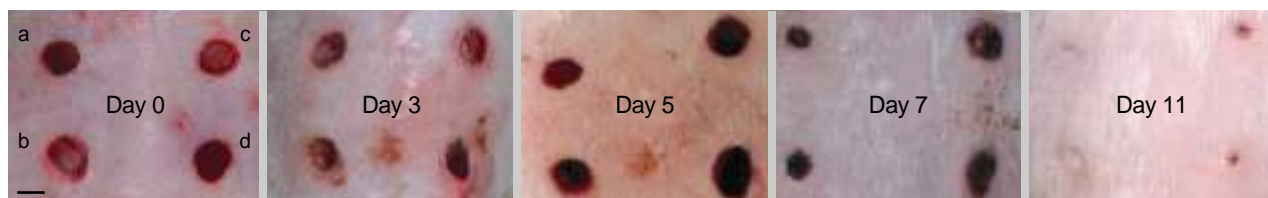
Fig. 1. The effects of ozonated olive oil on clinical wound closure. The photomicrographs demonstrate the enhanced wound closure, in the ozone group, on the left two wounds (a and b) on the back of the guinea pig, as compared to the oil group (c) as well as the control group (d). (Bar=5 mm).

As shown in Fig. 1, there was an enhanced wound closure in the ozone group of wounds, the left two of the four wounds, as compared to the oil group as well as the control group. On